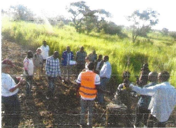
↑ Medical Mission Team planting trees on the NUSSP Site.