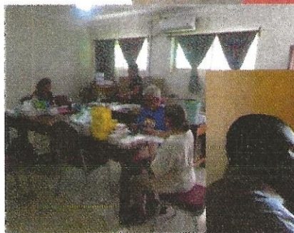
↑ Packaging medications for the clinic.

Project Website (Under Construction) https://nussp.org/